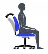
Back Angle Adjustment