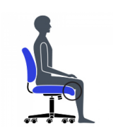
Waterfall Seat Edge