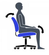
Chair Tilt Lock