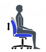
Back/Lumbar Height Adjustment