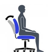
Back Angle Adjustment