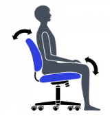
Chair Tilt Lock