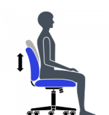
Back/Lumbar Height Adjustment