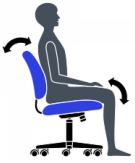
Chair Tilt Lock