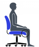
Waterfall Seat Edge