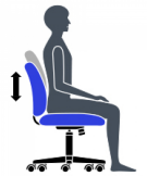
Back/Lumbar Height Adjustment