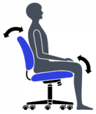
Chair Tilt Lock