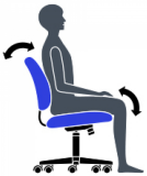
Chair Tilt Lock