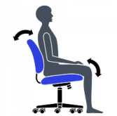
Chair Tilt Lock