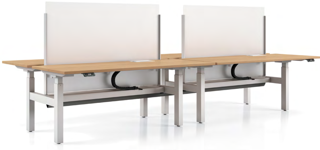
Stationary glass divider