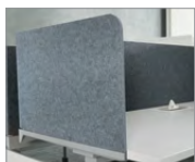
PET Felt wrap around divider