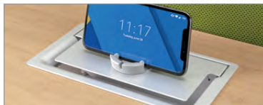
Access door with optional device holder, USB, power and cable tray (available on FreeFit benching only)