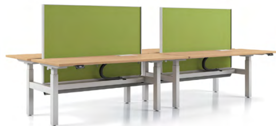
Stationary framed divider

Support individual control and personalization without impeding collaboration. Integrate height adjustability along a bench where you need it, while maintaining a unified aesthetic.