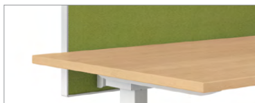
Table mounted screens