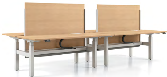
Stationary laminate divider