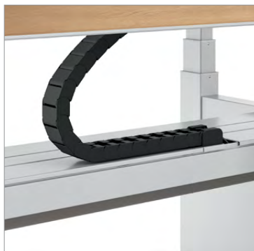
Cable chain manager connects table with power trough