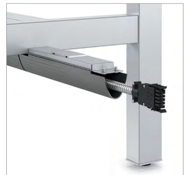
Table to table connector includes housing to housing harness