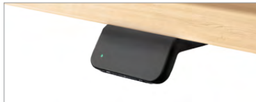
Standard handset with two position memory and Bluetooth capability