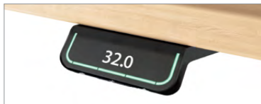
Optional digital handset with four position memory and Bluetooth capability